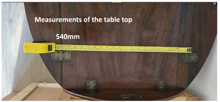
Measurements of the table top