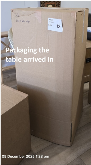
Packaging the table arrived in