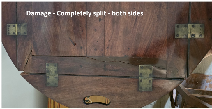
Damage - Completely split - both sides